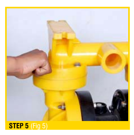
Remove the two small clamp bands which fasten the suction manifold to the liquid chambers. (Fig 5)