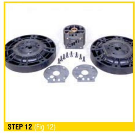
Inspect shaft block, air covers, shaft block gasket, allen bolts, pilot shaft bushes, O-rings. If found damaged, replace them.(Fig 13)