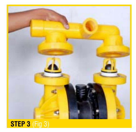
Lift away the discharge manifold to expose the valve balls and seats. (Fig 3)