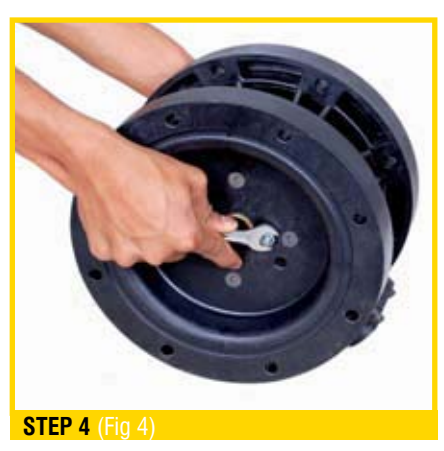
Remove pilot shaft by unscrewing two nylock nuts if found damage replace them. (Fig 5)