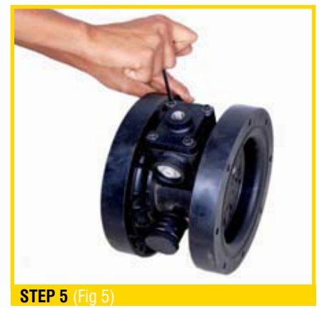
Remove the piston block from the shaft block and air cover. (Fig 6). There is no need to dismantle the air covers if there is no air leakage from the air covers. (Fig 6)