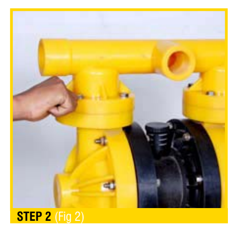
Utilizing a wrench, remove the two small clamp bands that fasten the discharge manifold to the liquid chambers. (Fig 2)