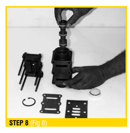
Remove the piston and check it. Replace it if worn out. (Fig 3) \,

For assembly, follow the reverse procedure.