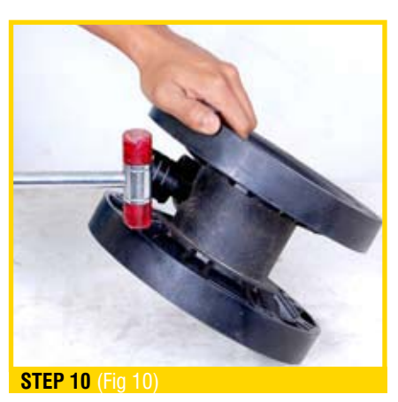
Remove air cover and check the gaskets. (Fig 11)