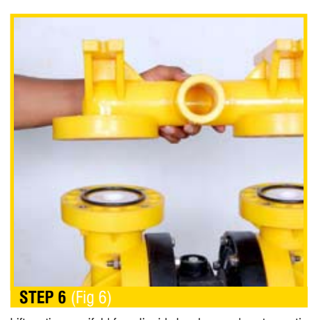
Lift suction manifold from liquid chambers and centre section to expose suction valve balls and seats. Inspect ball cage area of liquid chamber for excessive wear and damage. (Fig 6)