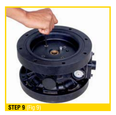
Unscrew the allen bolts to remove the air cover.