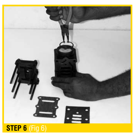
Remove circlip from piston block, check the piston block gasket. Replace it if damaged.(Fig 7)