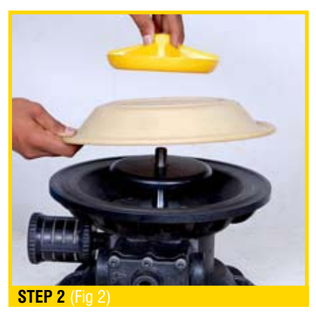
Remove the diaphragm & lock nut If diaphragm are damaged replace them (always replace both the diaphragm). (Fig 3)