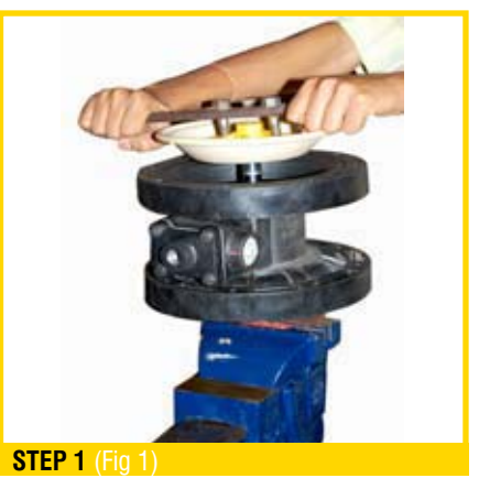
Fix the lock nut (outer piston) on the wise. Remove the locknuts (outer piston) with the help of a Bench wice.