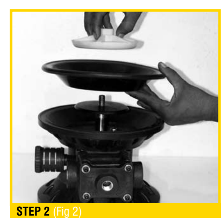
Remove the diaphragm & lock nut If diaphragm are damaged replace them (always replace both the diaphragm). (Fig 2)