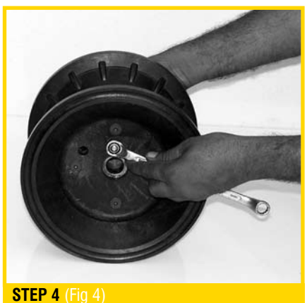
Remove pilot shaft by unscrewing two nylock nuts if found damage replace them. (Fig 4)