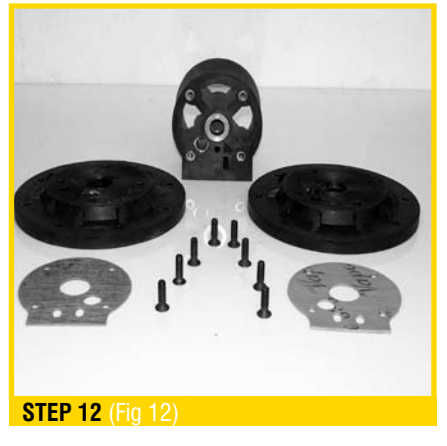
Check the air covers and shaft block gaskets. If found damaged, replace them.