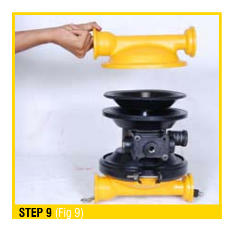
Lift liquid chamber away from center section to expose diaphragm and outer piston. (Fig 10)