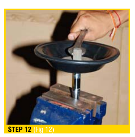
To remove diaphragm assembly from shaft, secure shaft with soft jaws (a vise fitted with plywood or other suitable material) to ensure shaft is not nicked, scratched, or gouged. Using an adjustable wrench or by hand, remove diaphragm assembly from shaft. Inspect all parts for wear and replace with genuine PRICE parts if necessary. (Fig 14)

1) The lock nut (outer piston), diaphragm and holding plate (inner piston) remain attached to the shaft and the entire assembly can be removed from the center section (Fig 12). 2) The lock nut (outer piston), diaphragm and holding plate (inner piston) separate from the shaft which remains connected to the opposite side diaphragm assembly (Fig 13). Repeat disassembly instructions for the opposite liquid chamber. Inspect diaphragm assembly and shaft for signs of wear or chemical attack. Replace all worn parts with genuine PRICE parts for reliable performance