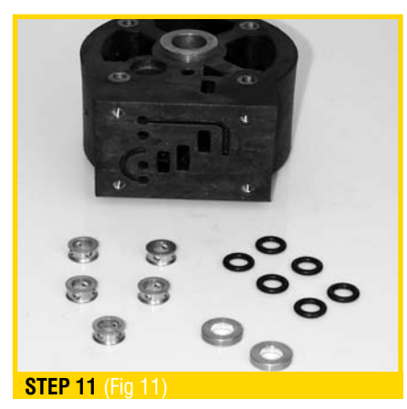
Pilot bushes with rings and '0' rings. (Fig 11)