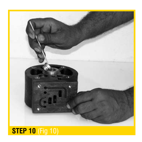
Remove the pilot bushes. Check the '0' rings. Replace if worn out or damaged. (Fig 10) \,