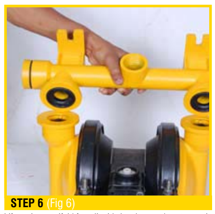
Lift suction manifold from liquid chambers and centre section to expose suction valve balls and seat. Inspect ball cage area of liquid chamber for excessive wear and damage. (Fig 6)