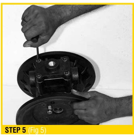
Remove the piston block from the shaft block by opening the 4 holding bolts. (Fig 5)