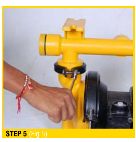
Remove the two small clamp bands which fasten the suction manifold to the liquid chambers. (Fig 5)