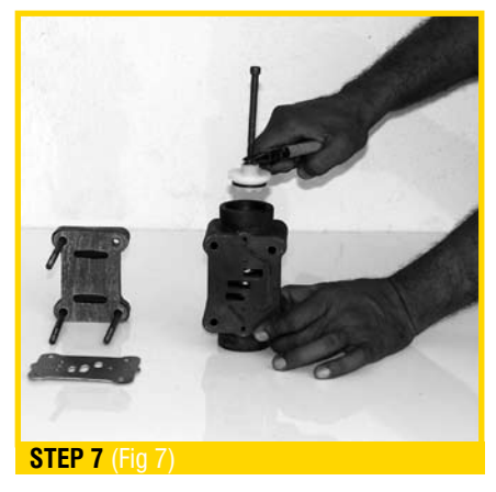
Remove piston block cap by help and holding bolts. Check the 'O' rings. Replace if worn out or damaged.(Fig 7)