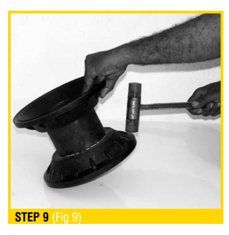
Remove air cover if required. Change gasket if Required. (Fig 9) \,