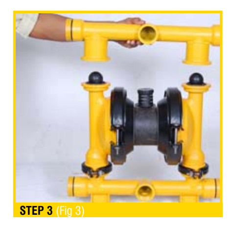
Lift away the discharge manifold to expose the valve balls and seats. (Fig 3)