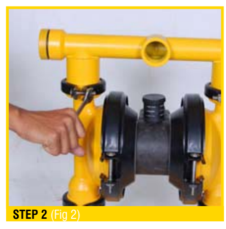
Utilizing a wrench, remove the two small clamp bands that fasten the discharge manifold to the liquid chambers. (Fig 2)