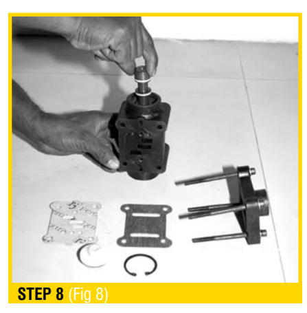
Remove the piston. Check Piston rings. Clean the piston with solvent. (Fig 8) \,