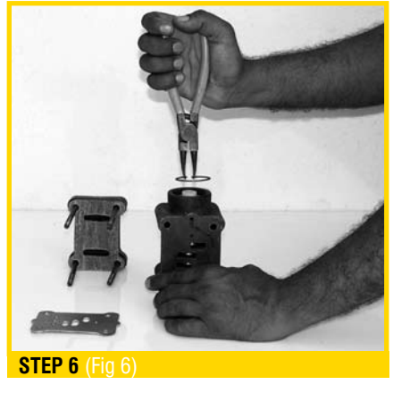
Remove the piston circlips, check piston block gasket and piston block cover. (Fig 6)