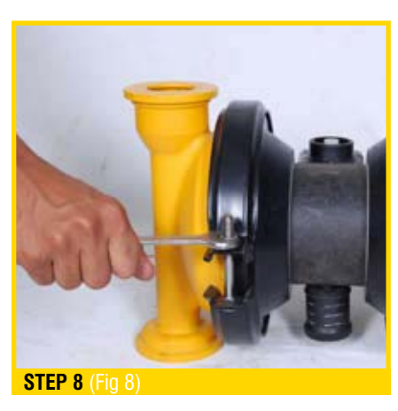
Remove one set of large clamp bands, which secure one liquid chamber to the center section. (Fig 9)