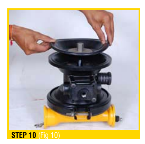
Using an adjustable wrench, or by rotating the diaphragm by hand, remove the diaphragm assembly. (Fig 11)