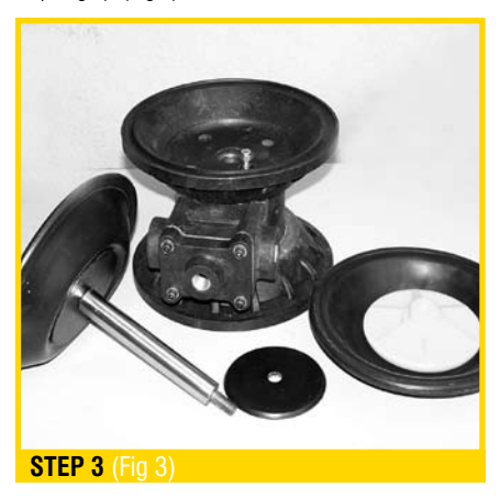
Now check the centre block i.e. air valve with air cover Take out main shaft, replace If worn out or scored. Check shaft block bush 'O' rings, replace If worn out. (Fig 3)