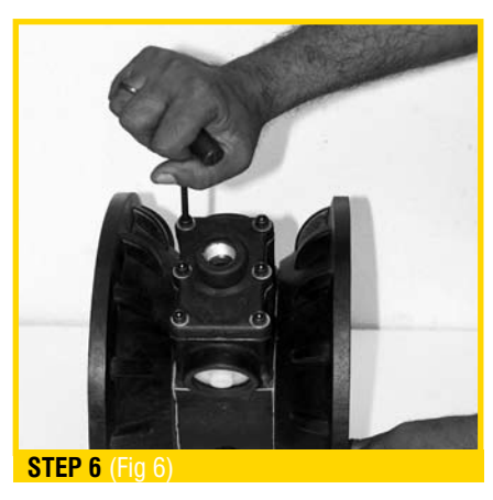
Remove the piston block from the shaft block and air cover. (Fig 6). There is no need to dismantle the air covers if there is no air leakage from the air covers. (Fig 6)