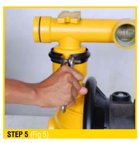
Remove the two small clamp bands which fasten the suction manifold to the liquid chambers. (Fig 5)