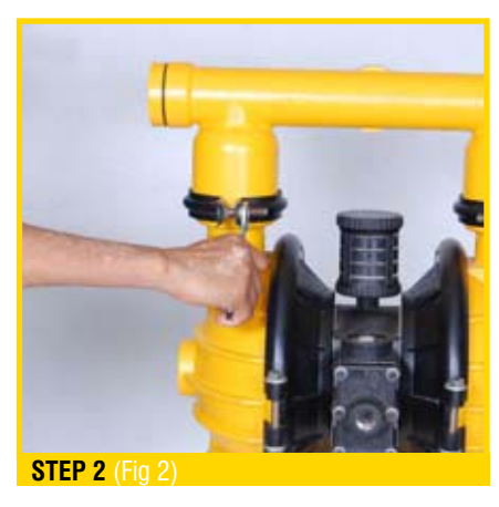
Utilizing a wrench, remove the two small clamp bands that fasten the discharge manifold to the liquid chambers. (Fig 2)