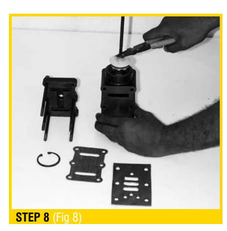
Take out the piston block cap by using mounting bolts. Check the cap with 'O' ring. (Fig 8) \,

For assembly, follow the reverse procedure.