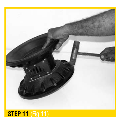
Remove air cover and check the gaskets. (Fig 11)