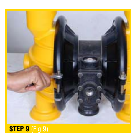
Remove one set of large clamp bands, which secure one liquid chamber to the center section. (Fig 9)