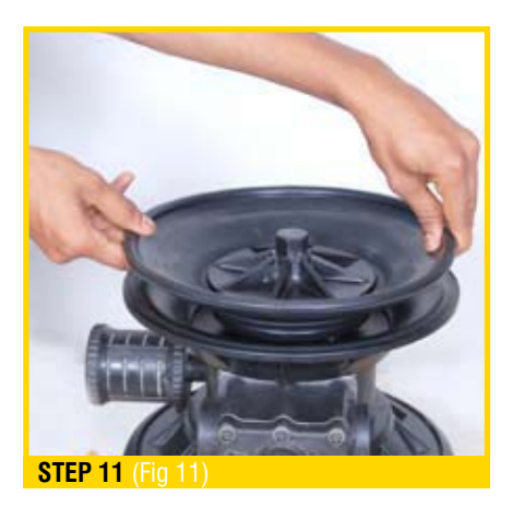
Using an adjustable wrench, or by rotating the diaphragm by hand, remove the diaphragm assembly. (Fig 11)