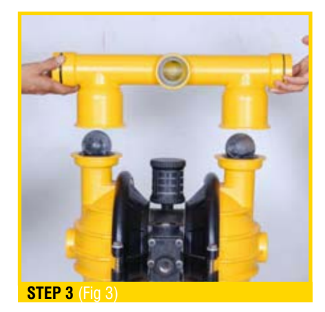
Lift away the discharge manifold to expose the valve