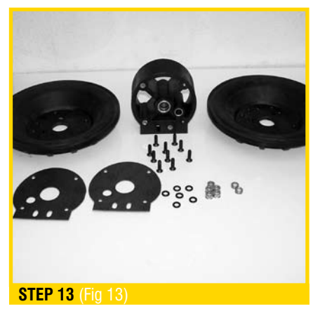
Inspect shaft block, air covers, shaft block gasket, allen bolts, pilot shaft bushes, O-rings. If found damaged, replace them.(Fig 13)