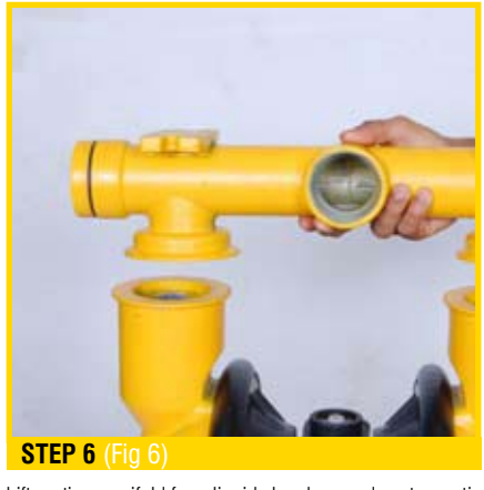
Lift suction manifold from liquid chambers and centre section to expose suction valve balls and seats. Inspect ball cage area of liquid chamber for excessive wear and damage. (Fig 6)