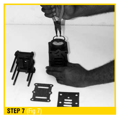
Remove circlip from piston block, check the piston block gasket. Replace it if damaged.(Fig 7)