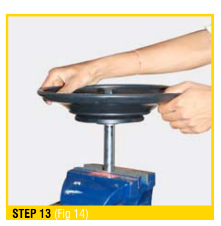
To remove diaphragm assembly from shaft, secure shaft with soft jaws (a vise fitted with plywood or other suitable material) to ensure shaft is not nicked, scratched, or gouged. Using an adjustable wrench or by hand, remove diaphragm assembly from shaft. Inspect all parts for wear and replace with genuine PRICE parts if necessary. (Fig 14)

1) The lock nut (outer piston), diaphragm and holding plate (inner piston) remain attached to the shaft and the entire assembly can be removed from the center section (Fig 12). 2) The lock nut (outer piston), diaphragm and holding plate (inner piston) separate from the shaft which remains connected to the opposite side diaphragm assembly (Fig 13). Repeat disassembly instructions for the opposite liquid chamber. Inspect diaphragm assembly and shaft for signs of wear or chemical attack. Replace all worn parts with genuine PRICE parts for reliable performance