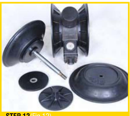
STEP 12 (Fig 12)

NOTE: Due to varying torque values, one of the following two situations may occur: