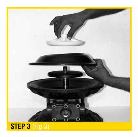
Remove the diaphragm & lock nut If diaphragm are damaged replace them (always replace both the diaphragm). (Fig 3)