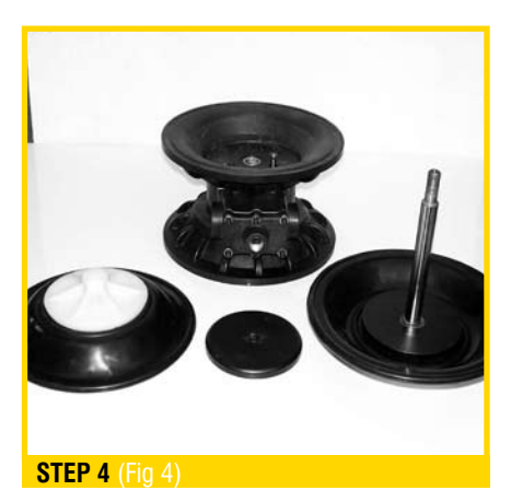
Now check the centre block i.e. air valve with air cover Take out main shaft, replace If worn out or scored. Check shaft block bush '0' rings, replace If worn out. (Fig 4)