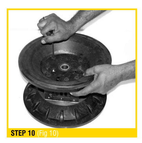
Unscrew the allen bolts to remove the air cover.