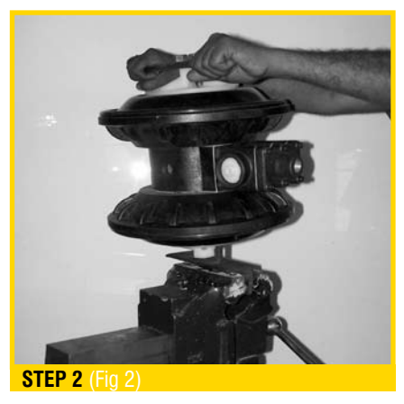
Remove the locknuts (outer piston) with the help of a Bench wice.