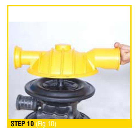
Lift liquid chamber away from center section to expose diaphragm and outer piston. (Fig 10)