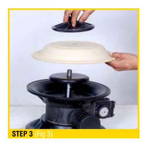
Remove the diaphragm & lock nut If diaphragm are damaged replace them (always replace both the diaphragm). (Fig 3)