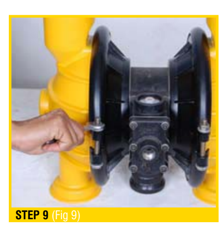
Remove one set of large clamp bands, which secure one liquid chamber to the center section. (Fig 9)