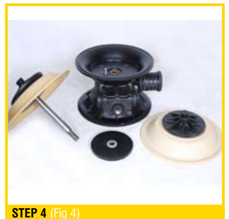
Now check the centre block i.e. air valve with air cover Take out main shaft, replace If worn out or scored. Check shaft block bush 'O' rings, replace If worn out. (Fig 4)