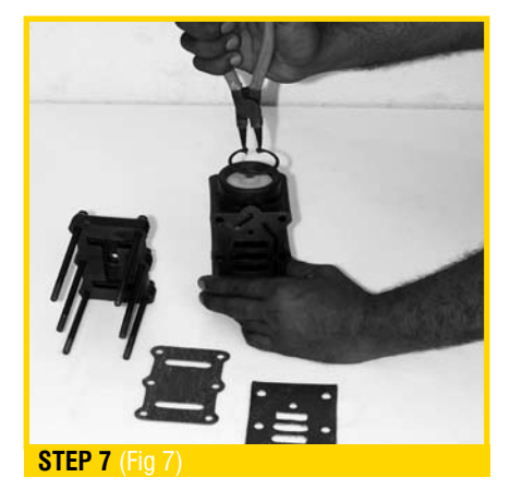
Remove circlip from piston block, check the piston block gasket. Replace it if damaged.(Fig 7)