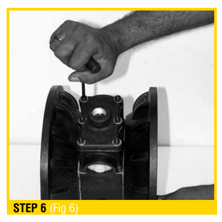
Remove the piston block from the shaft block and air cover. (Fig 6). There is no need to dismantle the air covers if there is no air leakage from the air covers. (Fig 6)