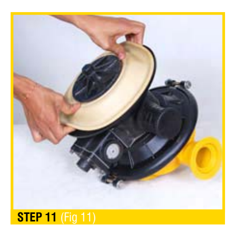
Using an adjustable wrench, or by rotating the diaphragm by hand, remove the diaphragm assembly. (Fig 11)