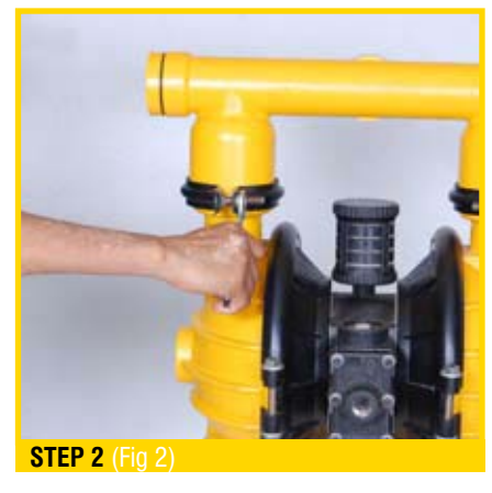
Utilizing a wrench, remove the two small clamp bands that fasten the discharge manifold to the liquid chambers. (Fig 2)