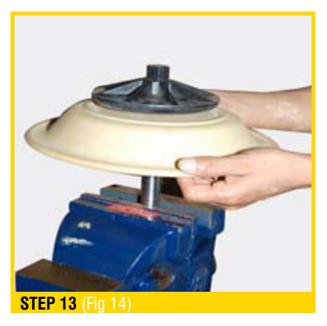
To remove diaphragm assembly from shaft, secure shaft with soft jaws (a vise fitted with plywood or other suitable material) to ensure shaft is not nicked, scratched, or gouged. Using an adjustable wrench or by hand, remove diaphragm assembly from shaft. Inspect all parts for wear and replace with genuine PRICE parts if necessary. (Fig 14)

1) The lock nut (outer piston), diaphragm and holding plate (inner piston) remain attached to the shaft and the entire assembly can be removed from the center section (Fig 12). 2) The lock nut (outer piston), diaphragm and holding plate (inner piston) separate from the shaft which remains connected to the opposite side diaphragm assembly (Fig 13). Repeat disassembly instructions for the opposite liquid chamber. Inspect diaphragm assembly and shaft for signs of wear or chemical attack. Replace all worn parts with genuine PRICE parts for reliable performance