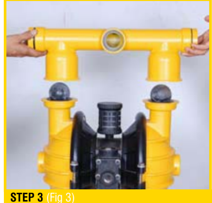
Lift away the discharge manifold to expose the valve balls and seats. (Fig 3)