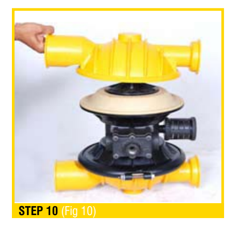
Lift liquid chamber away from center section to expose diaphragm and outer piston. (Fig 10)