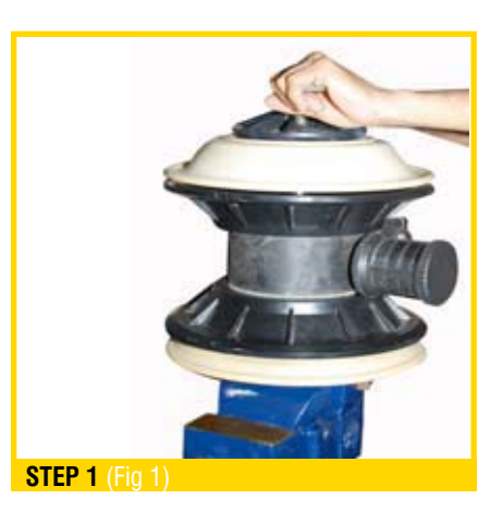
Fix the lock nut (outer piston) on the wise.